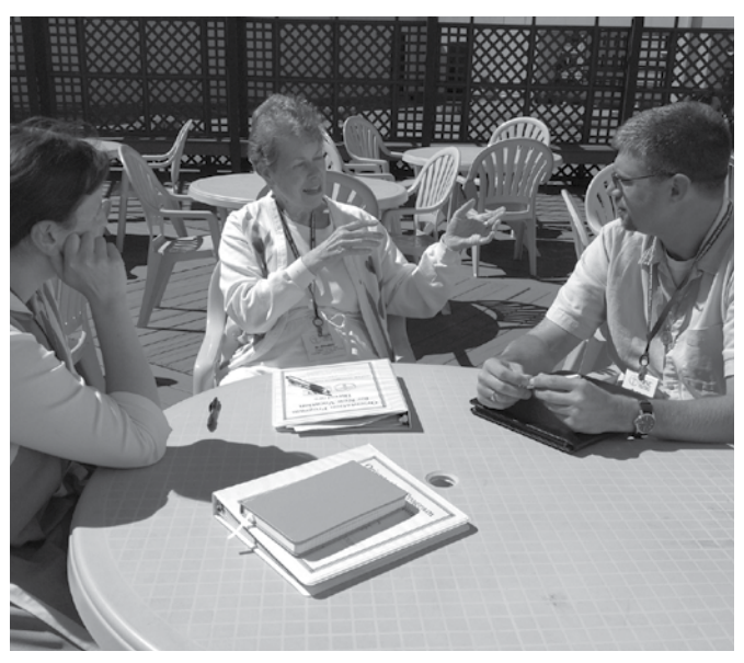
Summer Institute 2014 participants engage in a small group discussion.