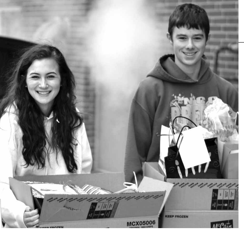
Students from Newport, Kentucky's Central Catholic High School take part in a food drive. Pope Francis has stressed both charity and justice for the poor.

commitment to the poor? As a student of liberation theology, I found it all very thrilling. All the more so to read in Evangelii Gaudium that the biblical message of "mercy to the oppressed" "is so clear and direct, so simple and eloquent, that no ecclesial interpretation has the right to relativize it" ( Evangelii , sec. 194). Pope Francis bluntly rejects "the absolute autonomy of the markets" and Adam Smith's "invisible hand" and calls upon Christians to live in solidarity with the poor, which he defines as "more than a few sporadic acts of generosity. It presumes the creation of a new mindset which thinks in terms of community and the priority of the life of all over the appropriation of goods by a few" ( Evangelii , sec. 202, 204, 188).