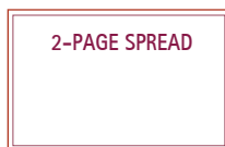
2-PAGE SPREAD: 15" x 10" TRIM SIZE: 17" x 11"