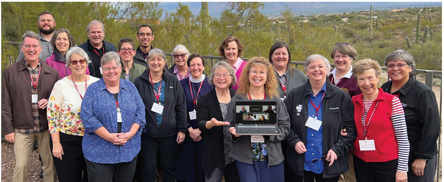
NRVC Board and staff with Member Area coordinators in Tuscon, AZ.