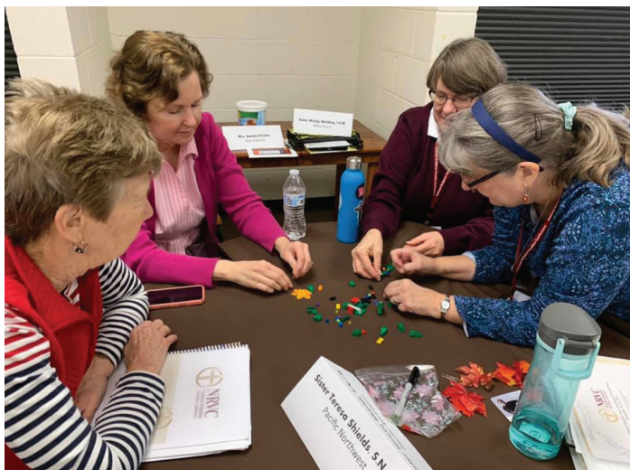
Member Area Coordinators work on a collaborative exercise at their 2021 gathering in Tucson.