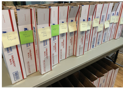
Summer Institute Care Packages.

Due to the generosity of the Conrad N. Hilton Foundation, the NRVC was able to invite 22 participants from the Asociación de Hermanas Latinas Misioneras en America, the Canadian National Association of Vocation and Formation Directors, the National Black Sisters Conference, the National Conference of Vicars for Religious, and Vocations Ireland, to participate in Summer Institute workshops.