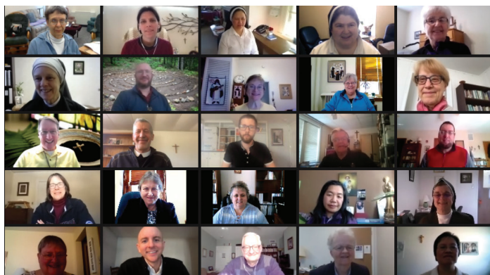
Second "Talk It Up, Tuesday" gathering, where members shared their ideas on Fratelli Tutti .